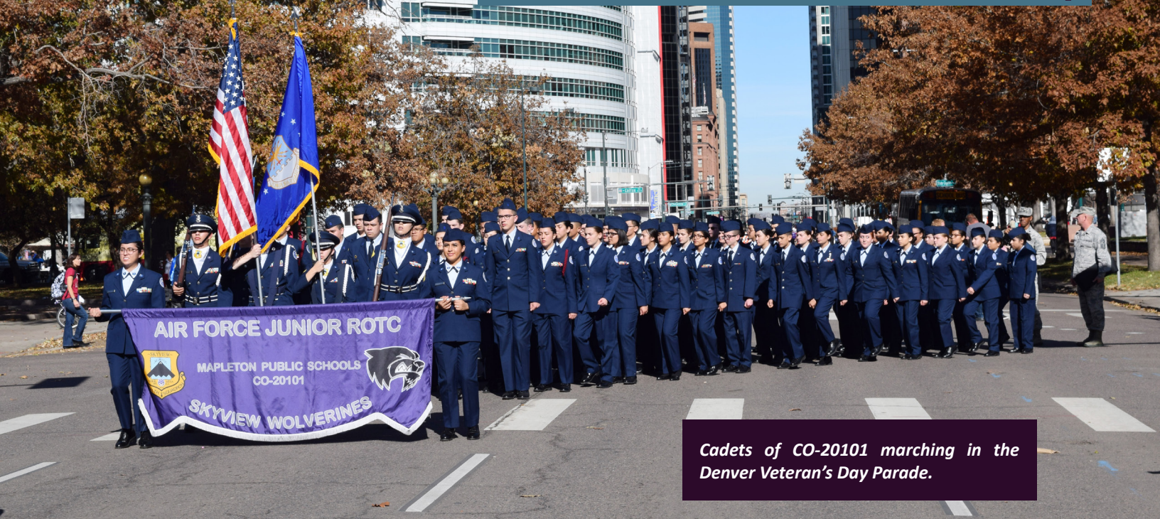
Cadets of CO-20101 marching in the Denver Veteran's Day Parade.