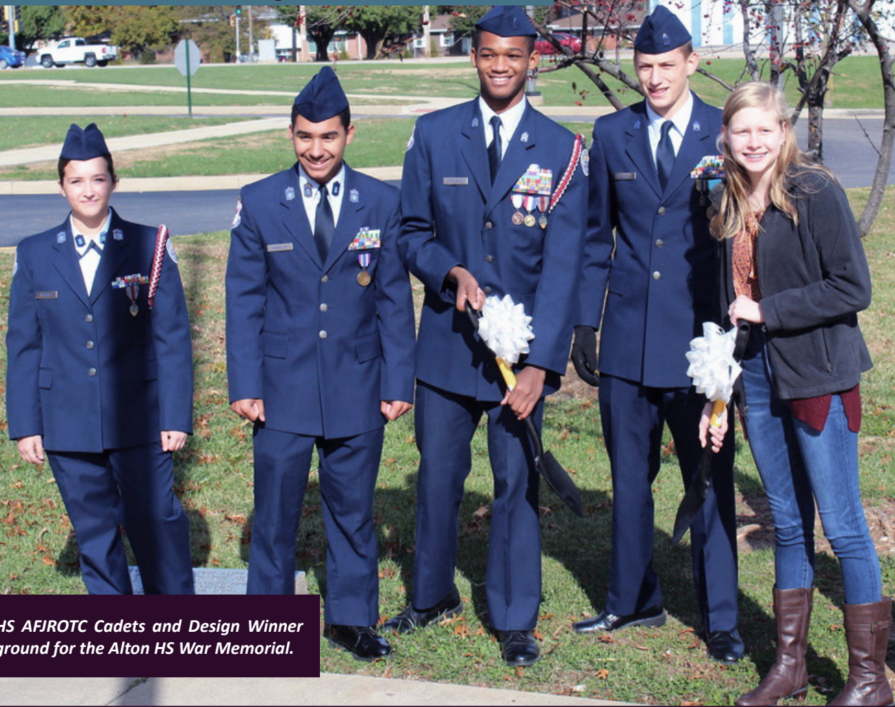
Alton HS AFJROTC Cadets and Design Winner break ground for the Alton HS War Memorial.