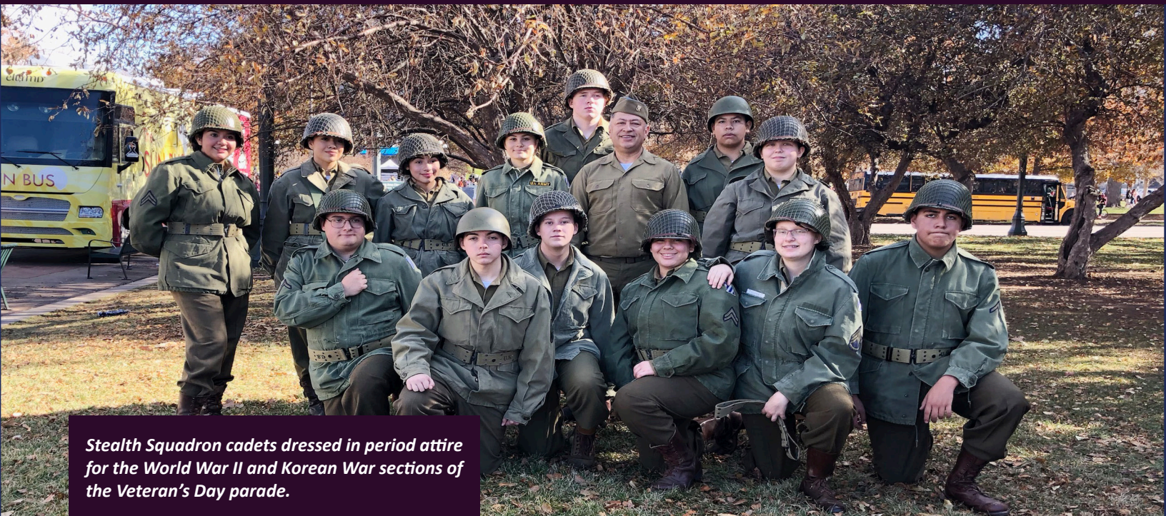
Stealth Squadron cadets dressed in period attire for the World War II and Korean War sections of the Veteran's Day parade.

In addition to marching in the parade, 13 Stealth Squadron cadets dressed in period attire from World War II and the Korean War and marched with personnel in that section of the parade. The vintage uniforms were donated by The Audie L. Murphy Infantry Museum. The mission of the museum is to educate the general public about America's military veterans from WWII and into the 21st Century. The cadets loved wearing the uniforms and getting a ride in a vintage jeep. The Stealth squadron cadets looked great that day!